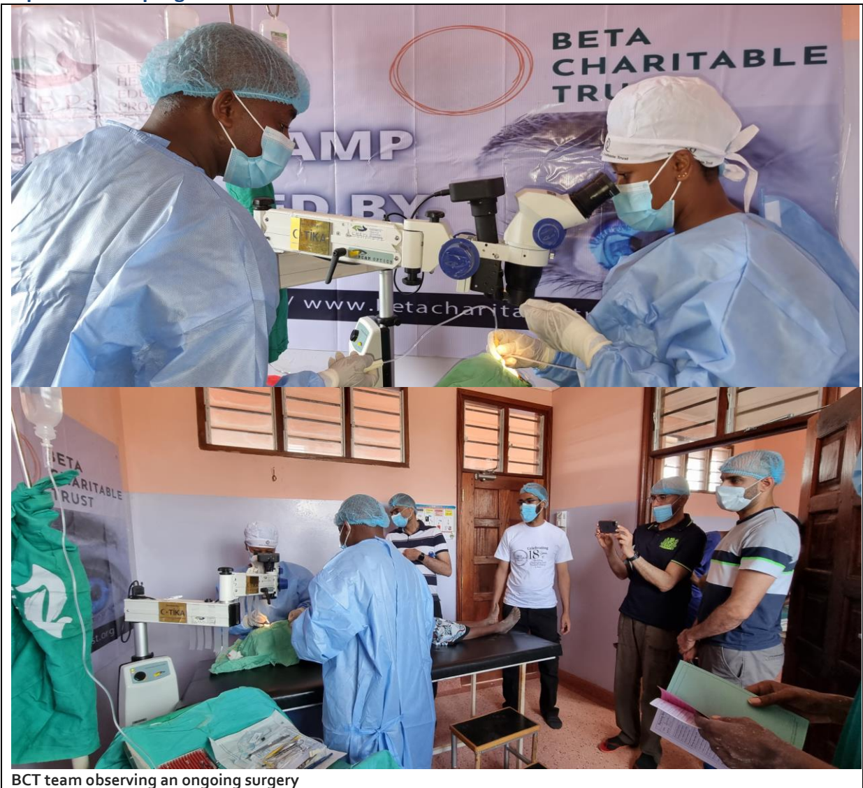
BCT team observing an ongoing surgery