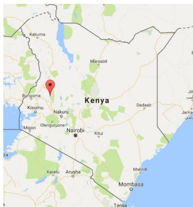
Map showing the location of Elgeyo Marakwet

Our 83 rd eye camp was held in Elgeyo-Marakwet in Biretwo village, one of the 47 counties in Kenya, located 393km North west of Nairobi. It has a population estimated at 369,998 people with over 55.5% poverty rate. The team operated 47 needy patients one of them being a bilaterally blind. All the 48 surgeries were successful and vision was restored.