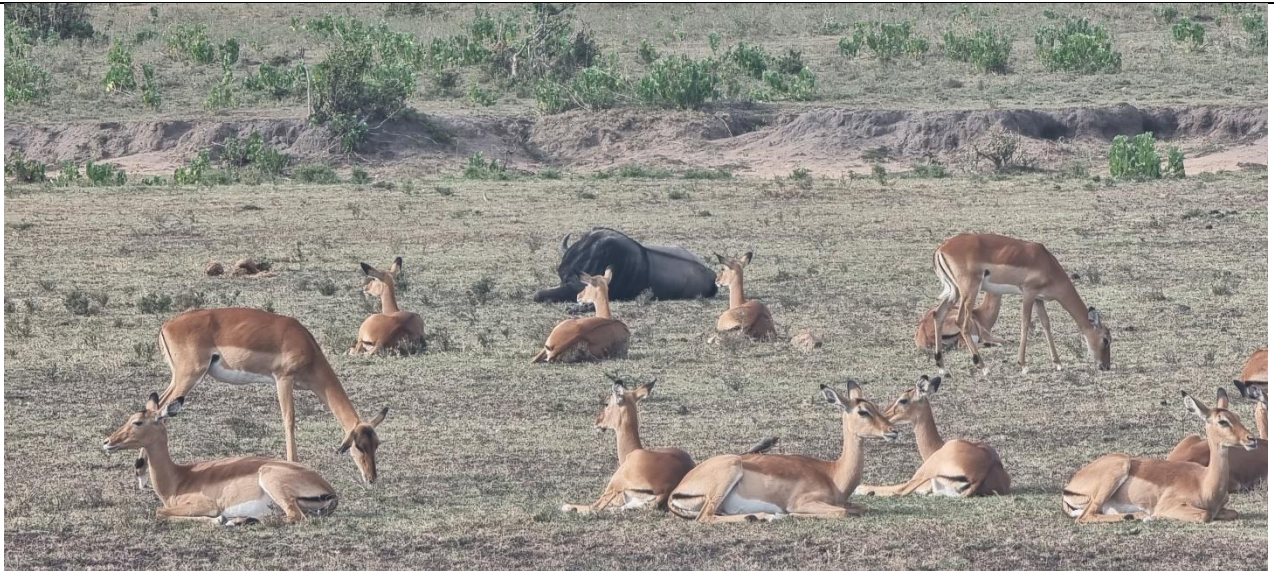
Gazelles and Wildebeest(in the background)