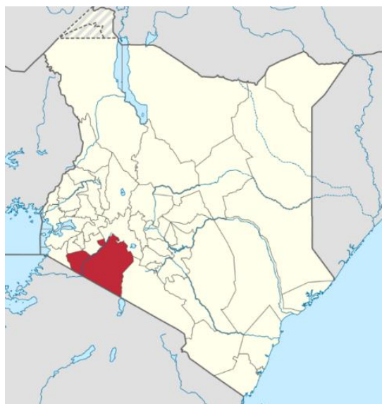
Map showing Narok County in Kenya