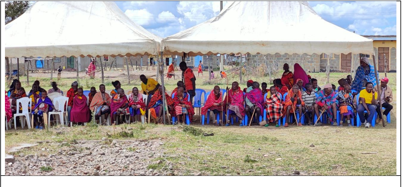
Screening in progress