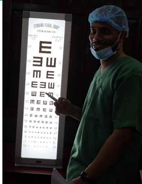
Sugeries in progress