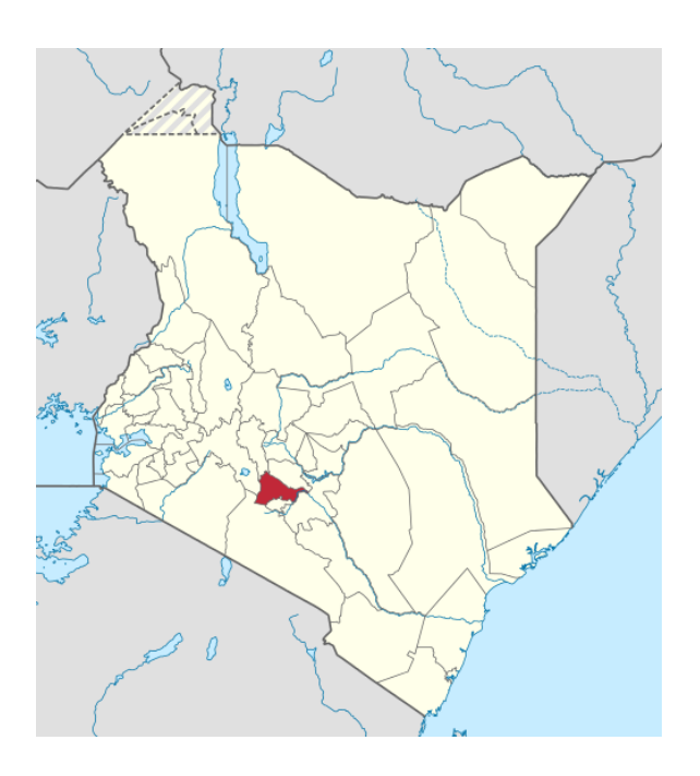
Map showing Kiambu County in Kenya