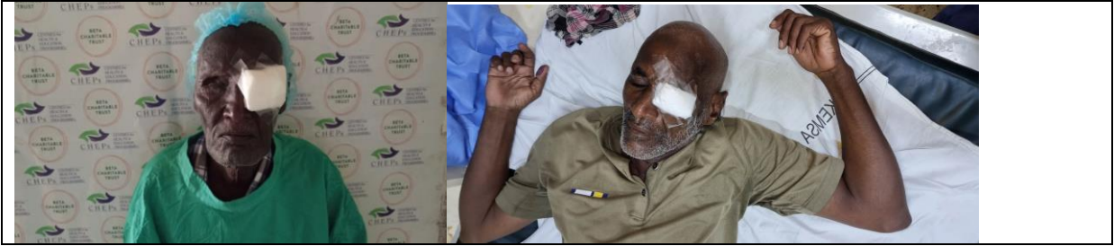
P. O. Box 23608-00100 Nairobi, Kenya | info@chepskenya.org | www.chepskenya.org