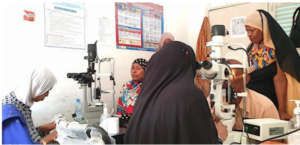
Patients being pre-screened