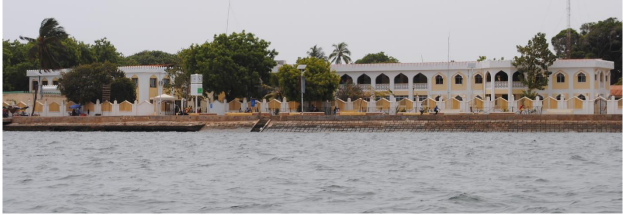
The beautiful view of King Fahad hospital from a distance