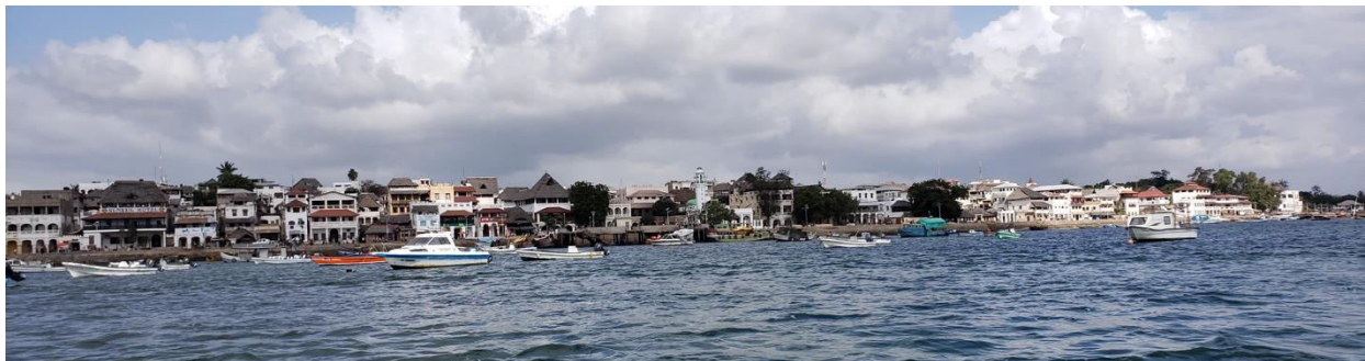
The beautiful view of Lamu Island from a distance

Our 93 rd eye camp was held in Lamu Island, also known as “The Island of festivals” is a UNESCO world heritage site that attracts tourists from all over the world. It however also faces a range of medical challenges including prevalent eye diseases.