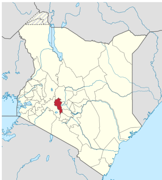
Map showing Nyandarua County in Kenya